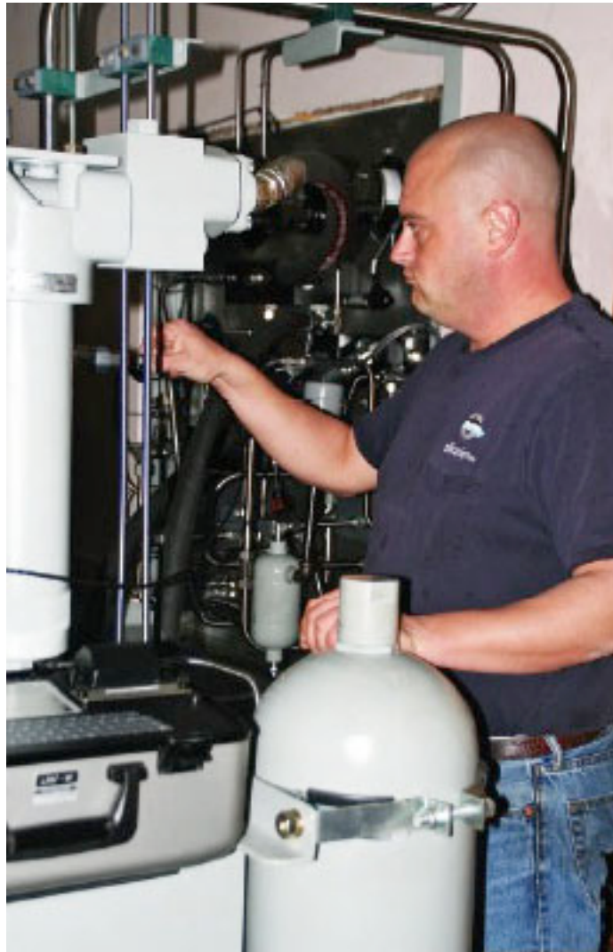
Service technician uses portable laser particle counter to determine if hydraulic oil is within ISO compliance standards.