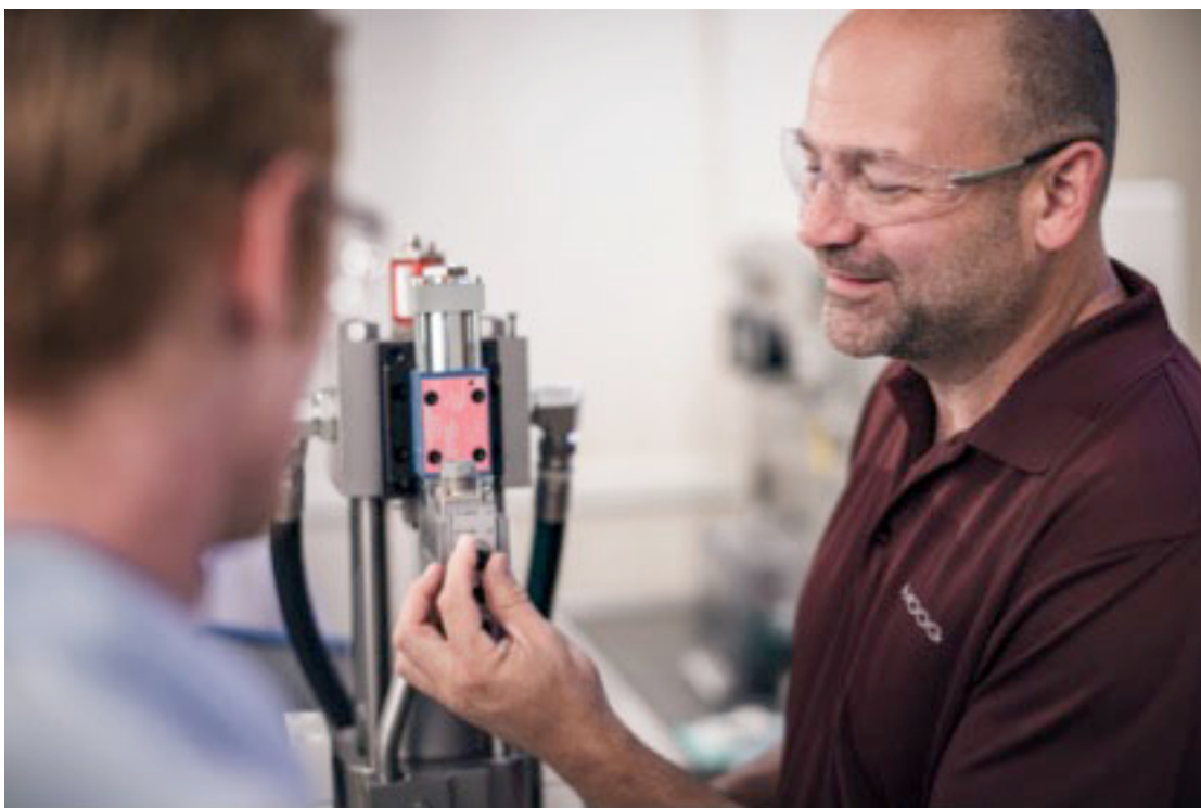
A technician receives hands-on training from a Moog maintenance expert.

Moog offers training, either on-site or in our factory to familiarize maintenance technicians with the functionality of the valve and how to utilize valve testers and other tools to determine if the valve is indeed the root cause of the issue. We also train on proper storage and handling techniques to ensure the valve on the shelf is ready for installation on your machine.